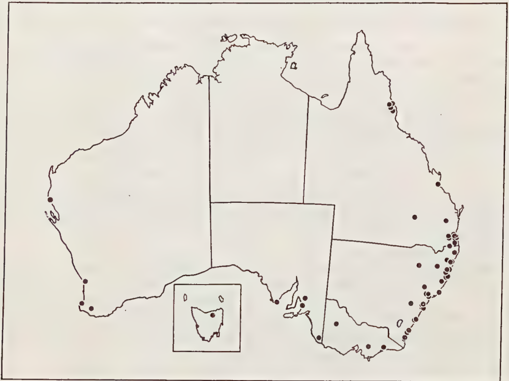
Fig. 2. Distribution of Nicandra physalodes in Australia.

N. violacea André ex Lemoine was distinguished from N. physalodes by its prominently blue corolla and suffused purple of the calyx, stems, petioles and peduncles, and the scattered coloured hairs on the upper surface of the leaves. Darlington & Janaki-Ammal